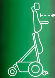
Stand while driving

Choose how you stand from three customizable standing sequences. The F5 Corpus VS offers sit-to-stand, semi-reclined or lay-to-stand techniques that are fully programmable to your individual needs. From face-to-face interactions to improved health outcomes, the F5 Corpus VS empowers you to experience the vast array of standing benefits.