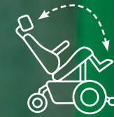
Full range power functions